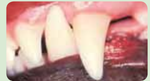
(1) Healthy mouth