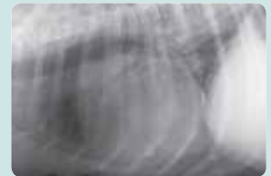
Chest x-ray of a dog with an enlarged heart and heart failure. Specifically formulated cardiac diets are a key part of treatment.